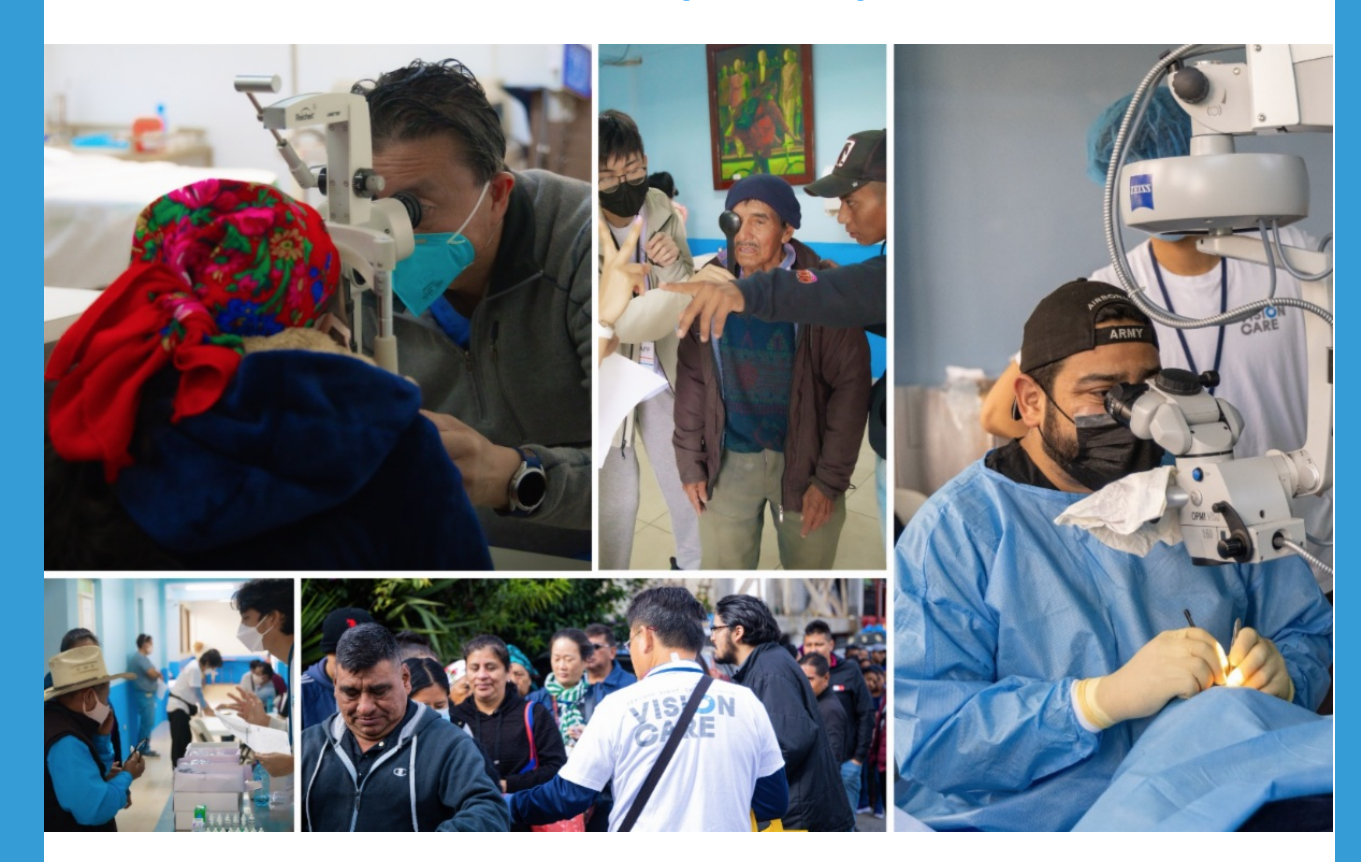
From July 1–8, Vision Care West held a Vision Eye Camp in Clínica Médica Bethesda (Hospital Bethesda) in Guatemala City, Guatemala. Through this Eye Camp, 679 people were screened and 78 sight-restoring surgeries were performed.