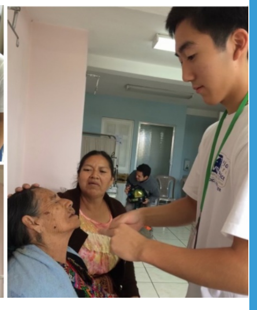
How has your experience with Vision Care shaped your decision to go into medicine?

Volunteering with Vision Care was one of the key experiences that sparked my interest in ophthalmology. As a young volunteer in international Eye Camps in Peru and Guatemala, I learned to appreciate the truly life-changing impact ophthalmic surgeries and services had on patients and their families – grandparents who could now function independently, parents who could now return to work, children who were now free to explore the world around them. Juxtaposed with my amazement was the realization that many communities around the globe needed greater access to vision-restoring services.